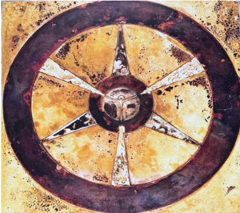
Meditation picture of Niklaus von Flüe Artistic design: Josua Bösch

«Peace is always in God, because God is the peace. ». Niklaus von Flüe