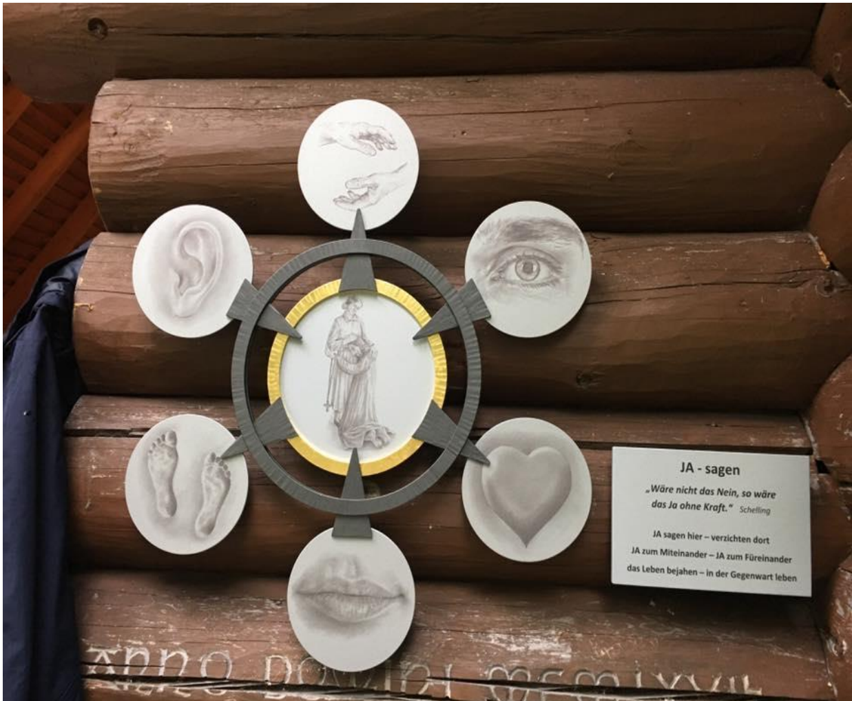
Photo: Sr. Izabela Swierad, SAC, General Superior of missionary pallottine sisters, Rome

For me, the following picture and the attached text is a convincing response, an attempt to understand a decision that ultimately remains a secret, and extremely precious mystery.